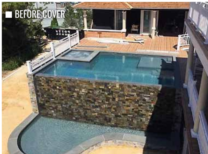
■ BEFORE COVER

■ SECUR-A-GAP™ (shown above) provides your cover with the perfect fit around protruding pool elements such as rock features and waterfalls without the loss of security that your safety cover provides.