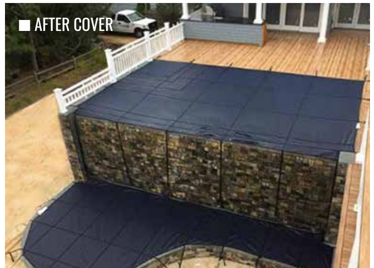
■ AFTER COVER